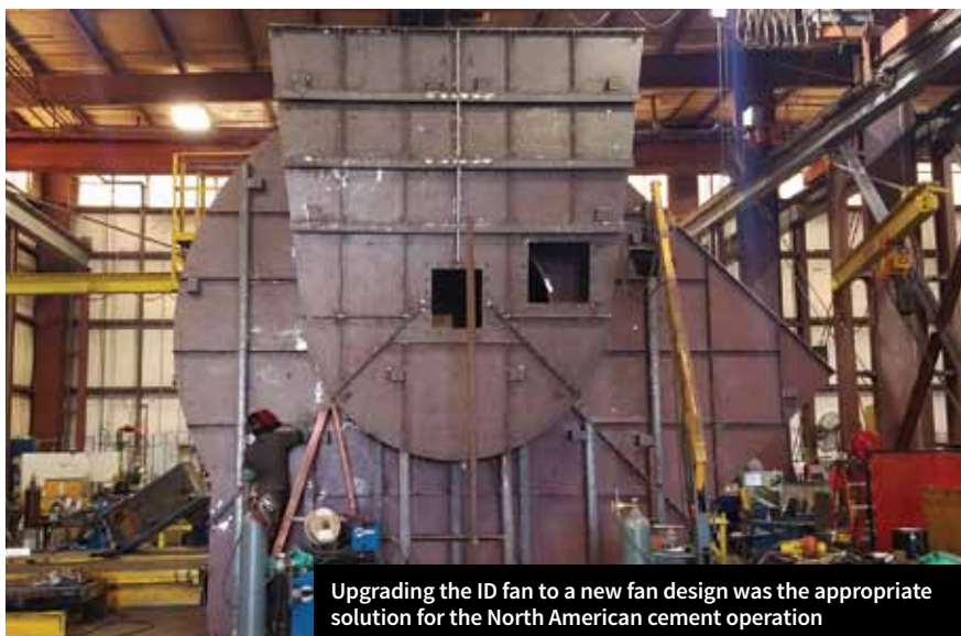
Upgrading the ID fan to a new fan design was the appropriate solution for the North American cement operation

After reviewing the field performance test results for the ID fan, Robinson's engineering team began to evaluate