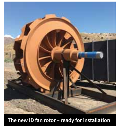
The new ID fan rotor - ready for installation