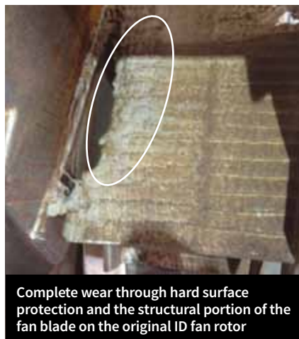
Complete wear through hard surface protection and the structural portion of the fan blade on the original ID fan rotor